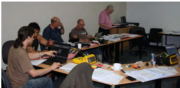
ACFM Training, Feb 2013