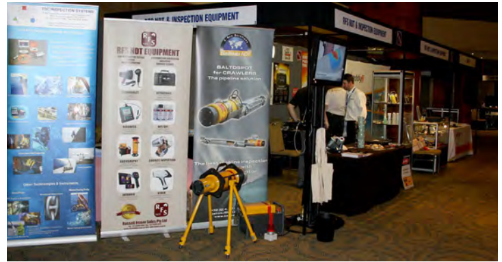
iWIN Conference 2013