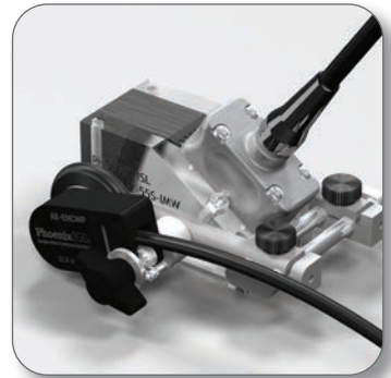
C-Clamp with side mounted encoder and phased array probe and wedge