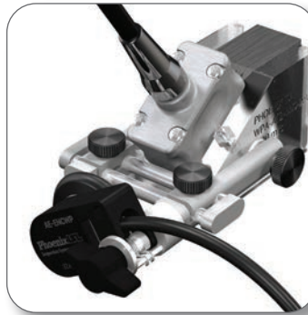
C-Clamp with rear mounted encoder and phased array probe and wedge