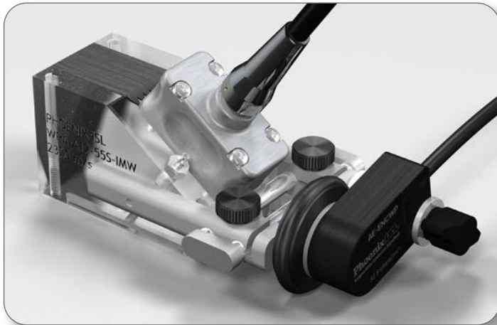
C-Clamp Encoder with phased array probe and wedge

The C-Clamp Encoder is a universal accessory for single axis inspections requiring no tools for setup and operation. The two clamping arms adjust up to 55mm separation to fit around a broad range of ultrasonic transducers and phased array wedges.