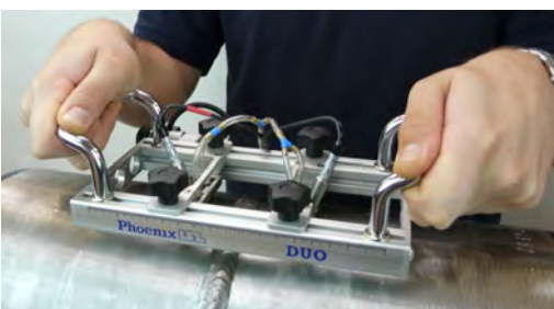
Hand-held Duo scanner

Wedges snap in and out of the Duo scanner frame without the need to unscrew any parts. Probe separation is quick and simple to adjust with a graduated scale which allows accurate positioning whilst maintaining probe alignment. Equipped with three strong magnetic wheels that provide adhesion and accurate tracking, the scanner also incorporates tool-free adjustments for varying pipe sizes and a brake for hand repositioning, so is ideal for rope access inspections.