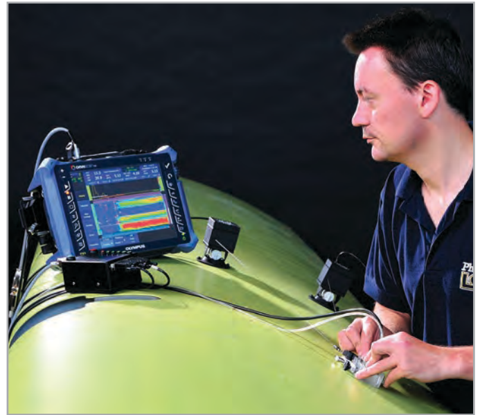
Typical scanning application