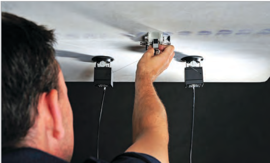
Tracer - Inverted scan inspection

Tracer is a versatile freehand scanning system that calculates and outputs accurate X-Y positional data for C-scan inspections without the constraints of a scanning frame. Tracer is ideally suited to operate with linear array probes to provide a fast, simple and flexible portable C-scan inspection kit.