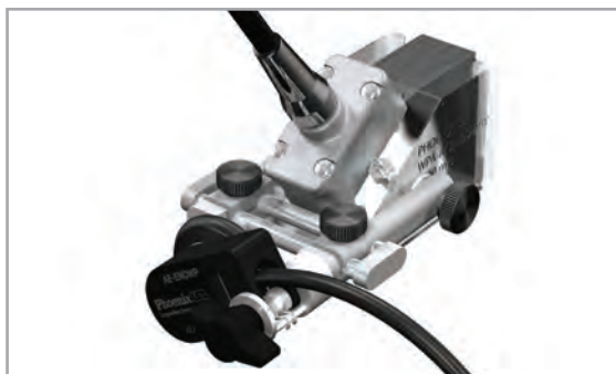
C-Clamp with rear mounted encoder and phased array probe and wedge