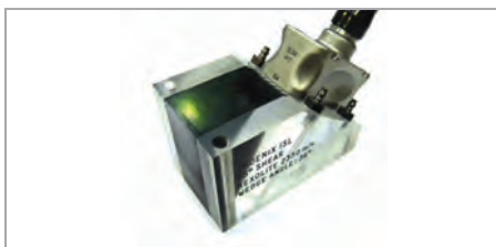
Phased array probes and wedges