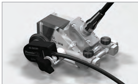
C-Clamp with side mounted encoder and phased array probe and wedge