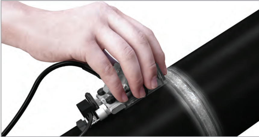
C-Clamp Encoder scanning a circumferential weld

The C-clamp encoder is a universal accessory for single axis inspections requiring no tools for setup and operation. The two clamping arms adjust up to 55mm separation to fit around a broad range of ultrasonic transducers and phased array wedges.