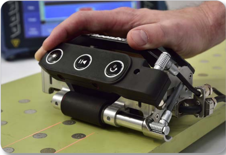
R-Evolution with laser guides

R-Evolution is an ultrasonic array probe housed in a light-weight glycerine-filled roller, delivering fast immersion quality C-scan inspections in the palm of your hand.