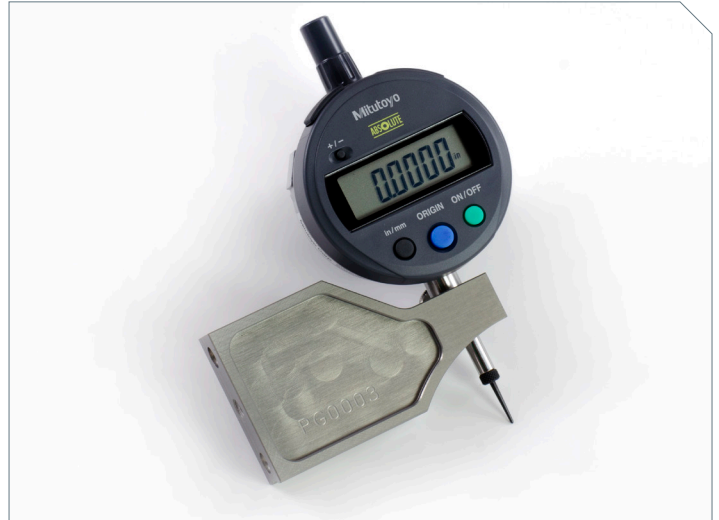
Standard Indicator and Blind Side Base