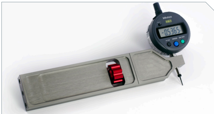
Standard Indicator and Blind Side Base with One Extension Arm