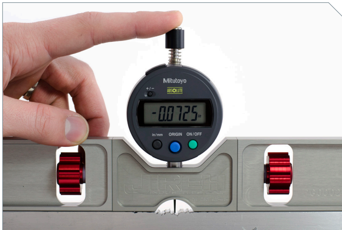
Reverse Spring Indicator (A-Style)