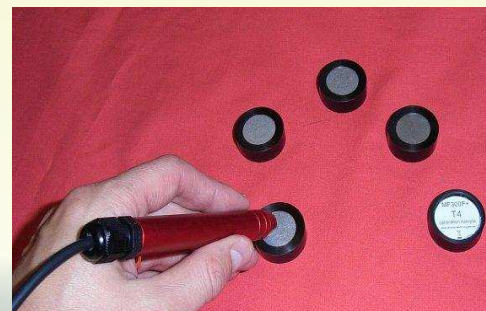
MF300Fe+ measuring the transfer standards

A variety of measurement modes are supported to ensure that good repeatable measurements can be made.