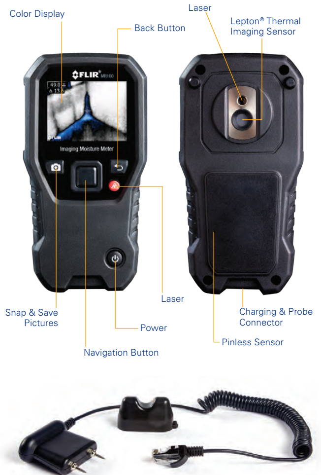
MR02 Pin Probe included