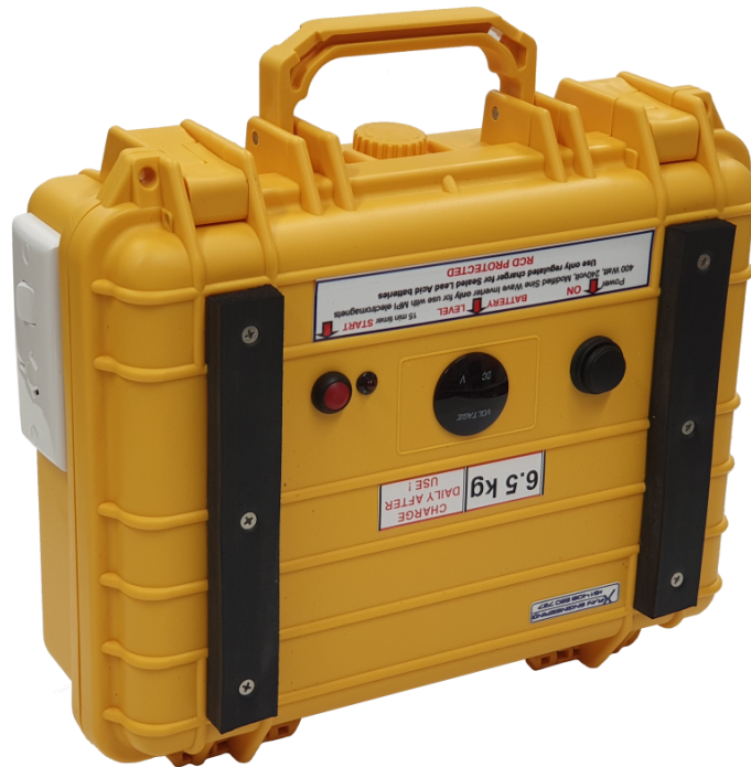
Figure 2. Mk-9X-RCD MPI Inverter. The 2.5 mm charging plug used in previous models has been replaced with a 3-pin plastic XLR to remove the chance of an OLYMPUS 24-volt Li-Ion power supply being inadvertently used.