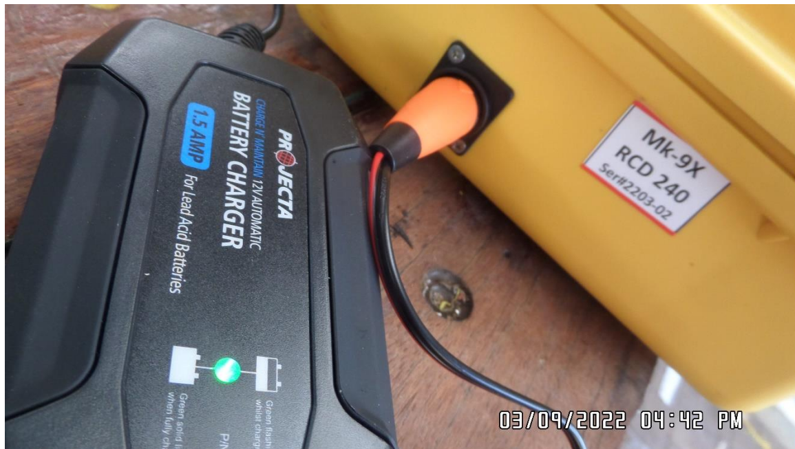
Figure 4. Projecta AC015 charger and XLR 3-pin charge plug replaces earlier model AC150 and 2.5mm charger plug.