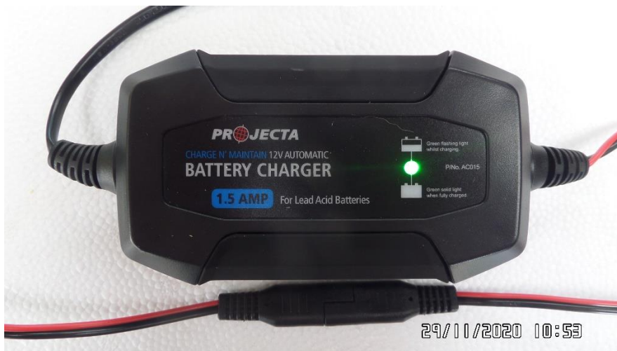
Figure 1. Flashing LED = Charging. Permanently on = Charged