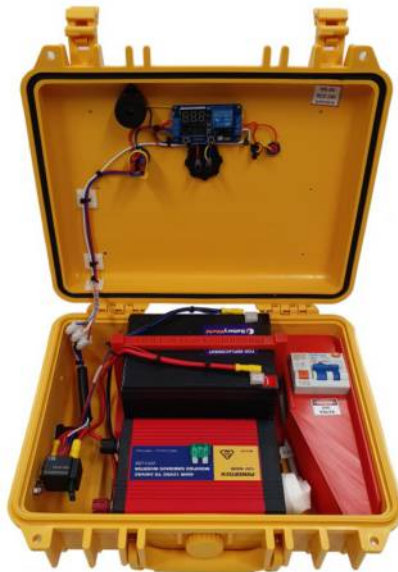
Figure 3 For transit and freight remove Red and Black battery cables by grasping the yellow spade terminals and removing from the battery. The shroud shown on the righthand side covers both GPO and RCD. The revised battery clamp secures the battery in 3 axes.