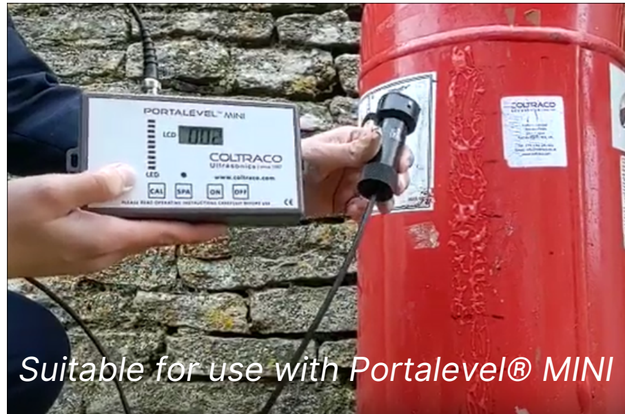
Suitable for use with Portalevel® MINI

1. Seamless and welded cylinder options now available as a selection for a wide variety of fire suppression agents