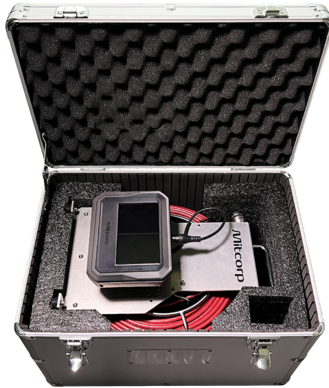
Aluminum carry case